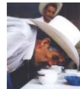
Coffee farmer qualifying Fair Trade coffee at a cupping competition.

TransFair strongly encourages farmers to participate in industry trade shows as a strategy for building stronger relationships with buyers and developing a better understanding of the US market. With the support of the DOEN Foundation and the Green Development Foundation, TransFair USA helped bring 75 Fair Trade farmers representing 29 export