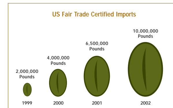
Companies imported 22.5 million pounds of Fair Trade Certified Coffee since 1999.

Fair Trade addresses the biggest supply chain threat to the specialty coffee industry: the dramatic decline in the quality of coffees arriving from traditionally high-quality growers in recent years. Due to current rock-bottom prices, farmers who normally produce specialty-grade coffees have been forced to cut back on production expenses, especially quality control measures. The specialty coffee industry – which now represents 40 percent of domestic coffee sales by revenue – is increasingly concerned about this trend. The emerging wisdom within the industry is that paying fair prices to farmers is the only way to maintain the high quality standards that discerning consumers demand. Fair Trade gives these companies an opportunity to achieve several goals at once: protect their supplies of high-quality products, instill social responsibility principles into their purchasing policies, and earn public recognition for ensuring a fair return to the grower. What makes this innovative model so powerful is its ability to align the interests of industry with the needs of farmers in a way that appeals to consumers, thereby allowing everyone to win.