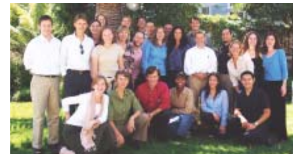
TransFair USA staff, interns, and volunteers.

♻️ Printed on 50% recycled and 15% post consumer waste paper.